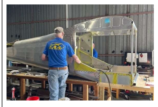
Cessna 150 - Steve